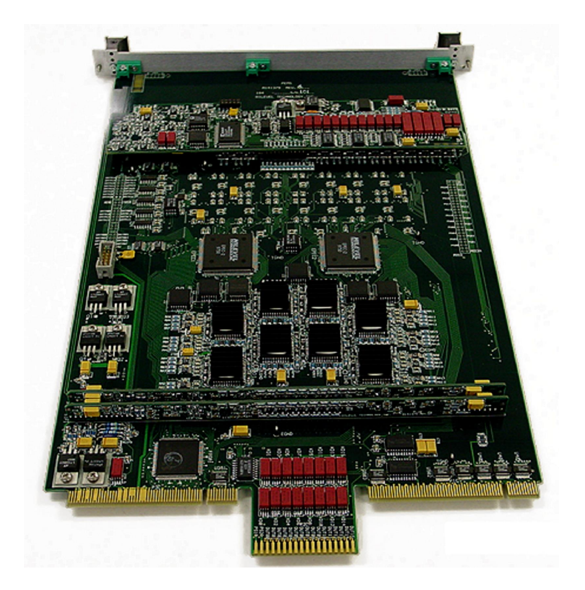
Figure 2: PMPMS + PEM => A Precision PMU Sub-system